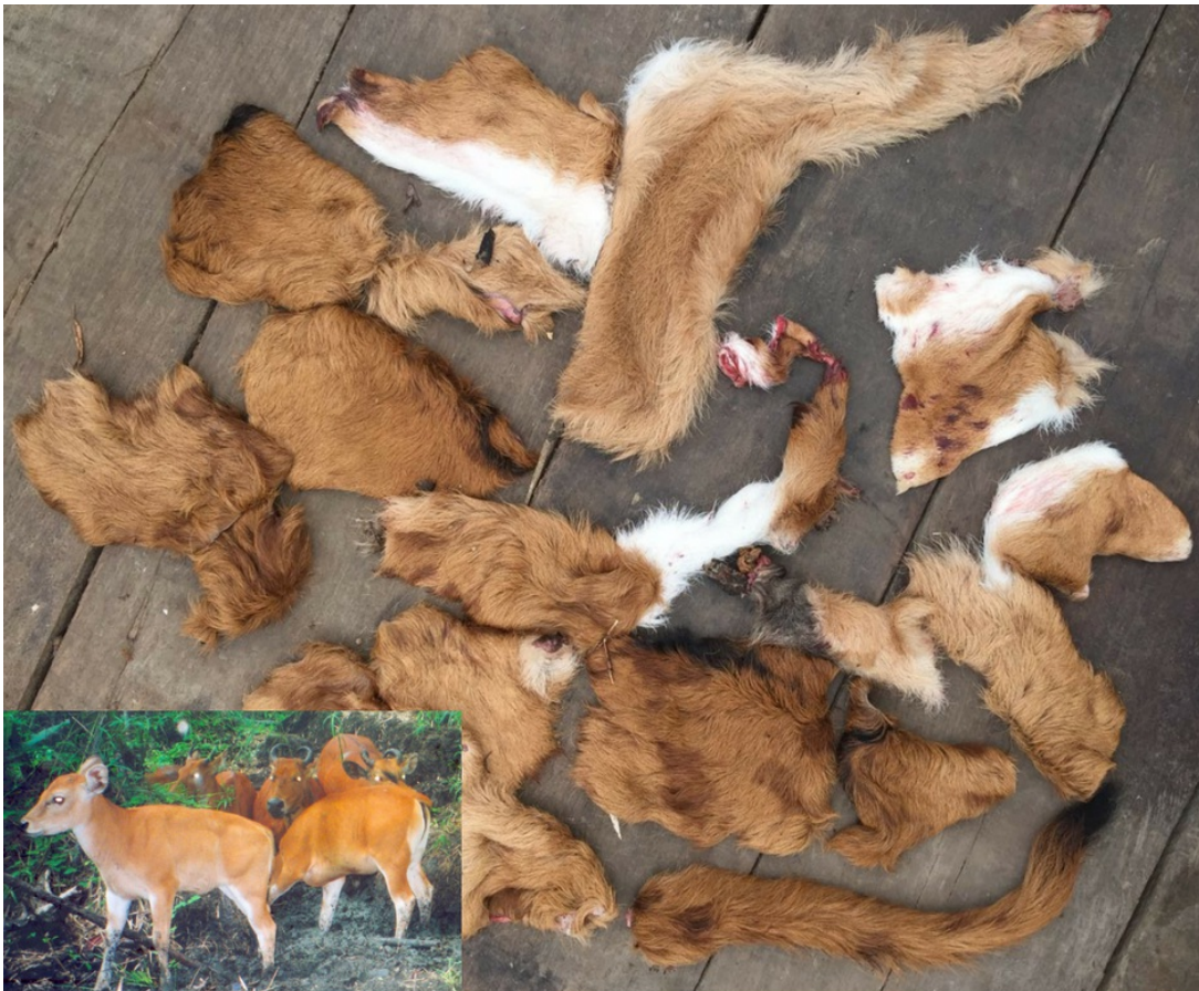
Extremely sad to see a Banteng Calf (Globally Endangered) was poached inside Chhep Wildlife Sanctuary in Preah Vihear despite efforts by the Wildlife Sanctuary Rangers and WCS Community Wildlife rangers to patrol & monitor this area day and night.

You can help! Boycott restaurants that sell wild meat