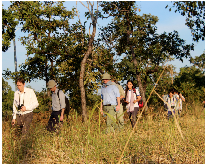
The EU Ambassador (front) is pleased to see the villagers have changed from being dependent on hunting wild birds to protecting them.