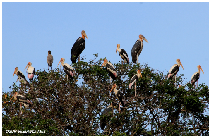
Lesser adjutants and Painted storks at Prek Toal Core Area and Ramsar Site.

Find out about Prek Toal Core Area Becomes A Ramsar Site.