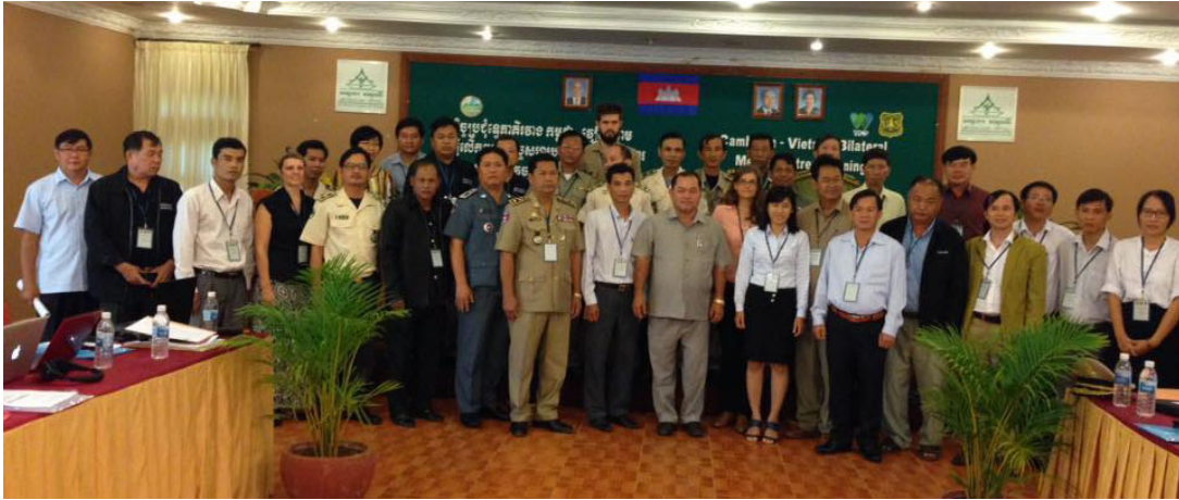
More than 50 government officials and NGOs staff delegate from Cambodia and Vietnam countries met together to discuss how to strengthen biodiversity conservation and law enforcement cooperation. The meeting aimed to prevent wildlife crime for local level between Monduliri and Kratie Provinces, Cambodia, and Dak Nong and Binh Phuoc Provinces, Vietnam.