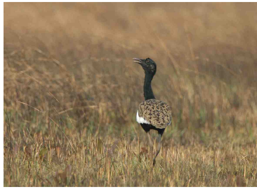
The Bengal florican is listed on the IUCN Red List as Critically Endangered, and has a global population of fewer than 800 individuals.

She added, "An estimated 20 percent of dry season rice fields are located within identified florican habitat, including formally protected areas. Forty-six percent of dry-season rice farmers cultivate two crops of rice per year, extending cultivation activities into breeding periods. This significantly reduces both the amount of time and habitat that floricans have to breed undisturbed and successfully." Read full story