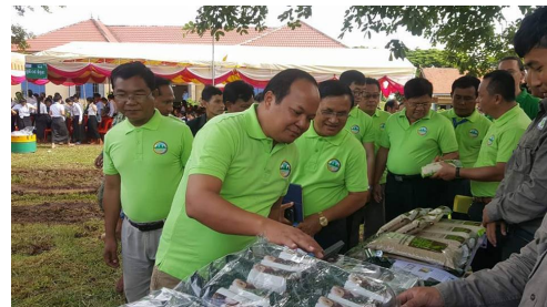
WCS partner, Ibis Rice, displayed its rice product during the event.

WCS joined the Ministry of Environment, non-governmental organizations and other 400 local students and community members to mark the celebration of World and National Environment Day 2017 at Kulen High School, Preah Vihear Province.