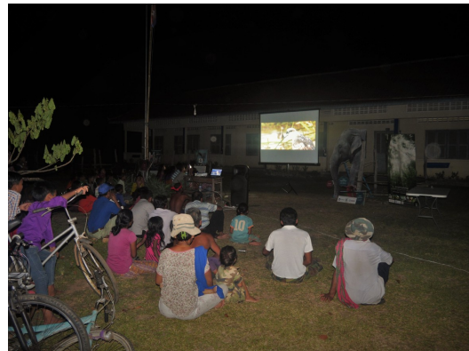
Cambodian Nature Film screening in front of Tmatbouy villagers.

This nature film shows the wonders of wildlife in Cambodia through various conservation projects from across the country. A section of this video highlights the unique dry forest ecosystem found around Tmatbouy Ecotourism Community Protected Area that is home to two species of Critically Endangered ibis, the White-shouldered Ibis and Cambodia's National bird, the Giant Ibis. Read full story